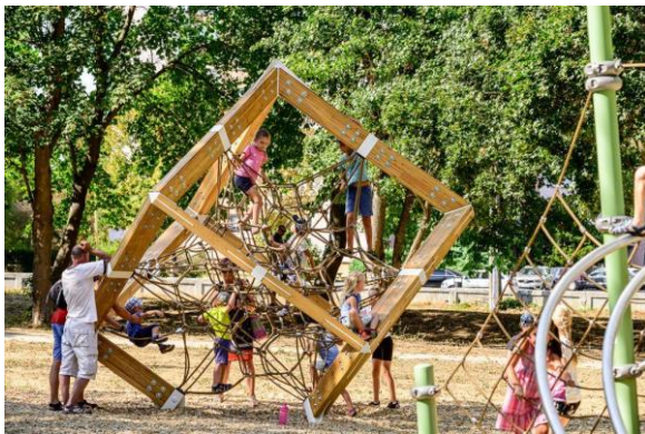
Kerta park in Michalovce

The aim of the project was to revitalize the nature park Kerta in the Town of Michalovce and the 'Széphalom' park in the town of Satoraljaújhely. Planting and tree care, and the restoration of small park architecture and pavement network significantly improved the attractiveness of the environment in the built-up urban area. While restoring this historical greenery was aimed to preserve the natural heritage available locally.