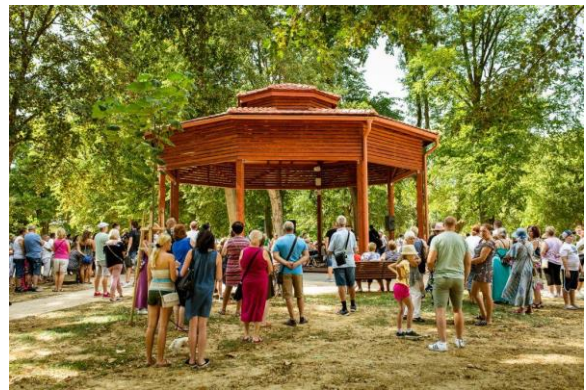
Széphalom park in Satoraljaújhely